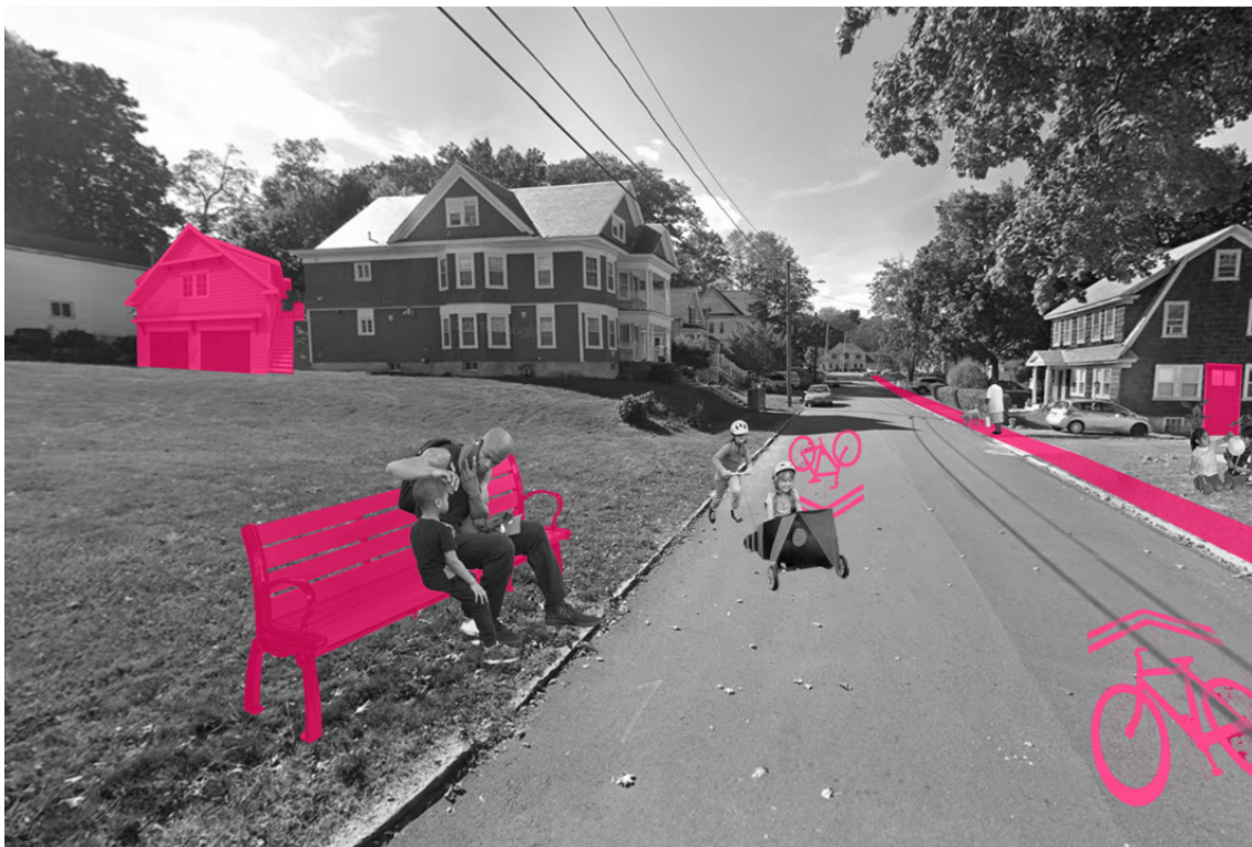
Figure 2. Applying the Age-Ready Belvidere Toolkit to Belvidere's Residential Neighborhoods. The application of the toolkit re-imagines a residential street in Belvidere through transportation and housing-related interventions to enable a more lively, safe, and livable environment.